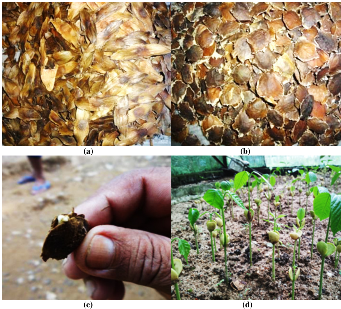
Fig. 4: (a) Mature borpat seeds with wings (b) Borpat seeds without wings (c) Germinated seed (d) Epigeal germination in borpat seedlings, [cotyledons (seed leaves) emerge above the soil surface during the early stages of seedling development].