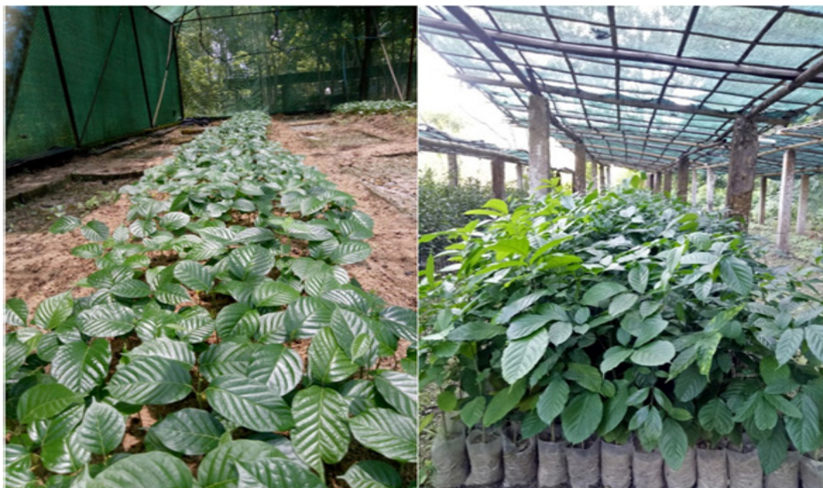
Fig. 5: Borpat seedlings in nursery bed and polybags.

environment of the nursery to the more variable conditions of the field (Fig. 6). Studies by Patel et al. (2020) indicates that seedlings transplanted at 6–8 months with a height of 2–2.5 feet have a significantly higher survival rate and better growth performance in the field. This is because they have developed a strong root system and are less susceptible to environmental stresses than younger, smaller seedlings.