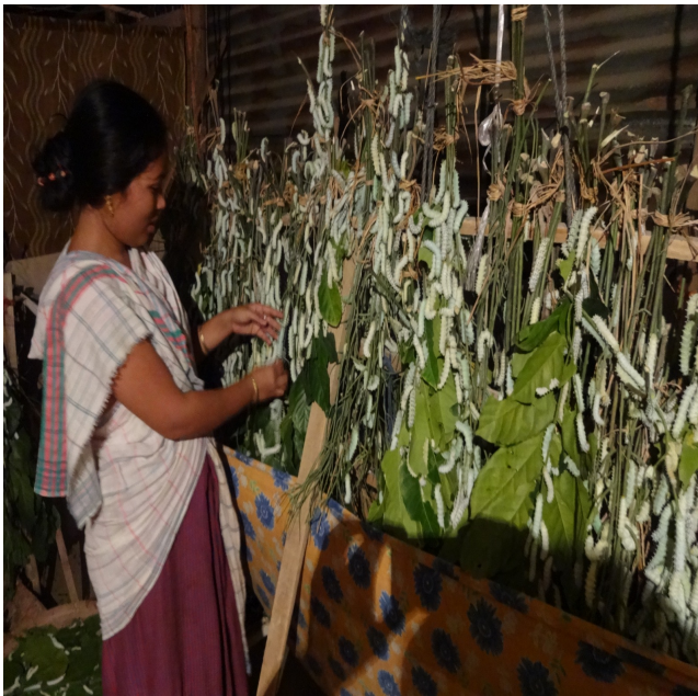
Fig. 1: Eri silkworms rearing on borpat leaves at farmer's level