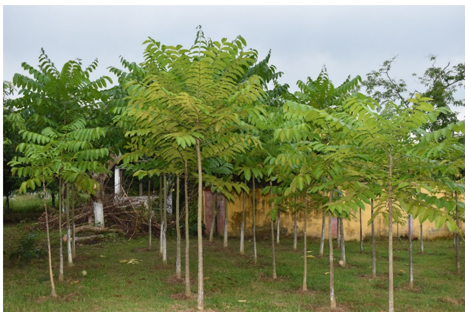
Fig. 6: Systematic plantation of Borpat in the field for ericulture.