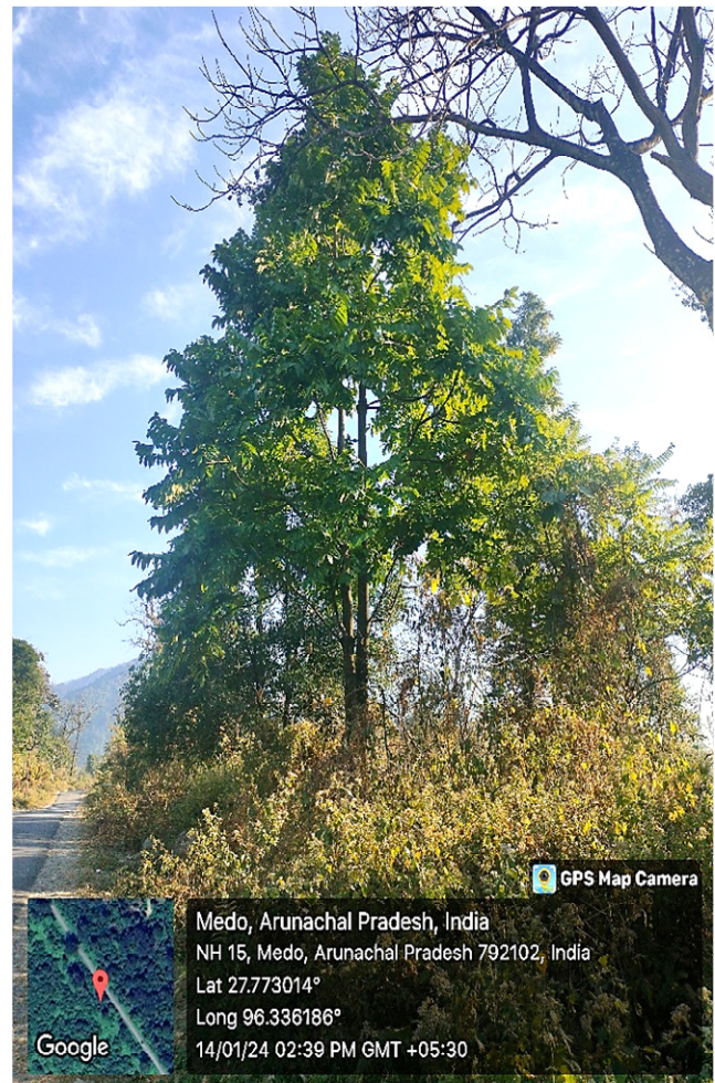
Fig. 2: Naturally growing borpat tree (tree of heaven) at Medo in Arunachal Pradesh.

The borpat tree features compound, alternate leaves that are 15–20 cm long. It is recognized for its rapid growth and is commonly found in tropical moist and deciduous forests at altitudes of up to 1200 meters (Fig. 2). In India, it is predominantly found in the states of West Bengal, Arunachal Pradesh, Assam, Meghalaya, and Sikkim. In West Bengal, borpat is found in the Buxa, Kalimpong, and Tista Valley areas (Ghosh and Mallick, 2014). In Assam, its presence is noted in Lakhimpur-Borphathar, Sibsagar-Merapani, Cachar-Lambabak, Barak, Rongagora, Digboi, Jeyapore, Khasi Hills, and Jaintia Hills, specifically in Nongkla and the Garo Hills (Kanjilal et al. , 1934). In Arunachal Pradesh, the borpat is found in the forest areas of Pasighat, Sagalee, and Hapoli (Fig. 3).